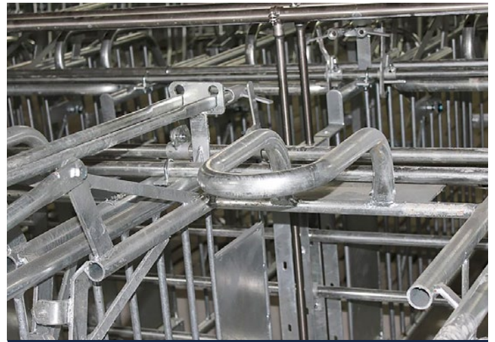
Easy access to sow