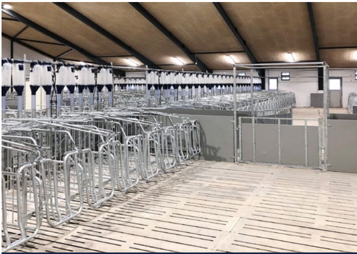
Gestation unit with L-pens and free access stalls