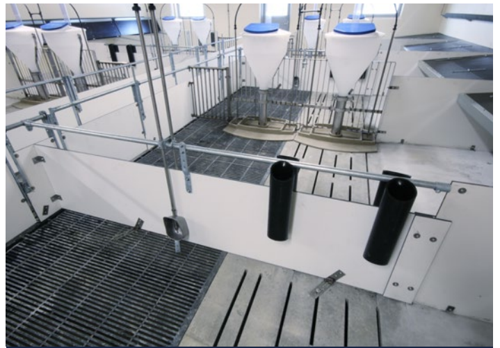
Penning and mounting