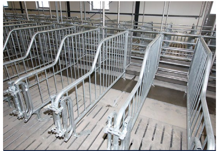
Mating stall with saloon gates