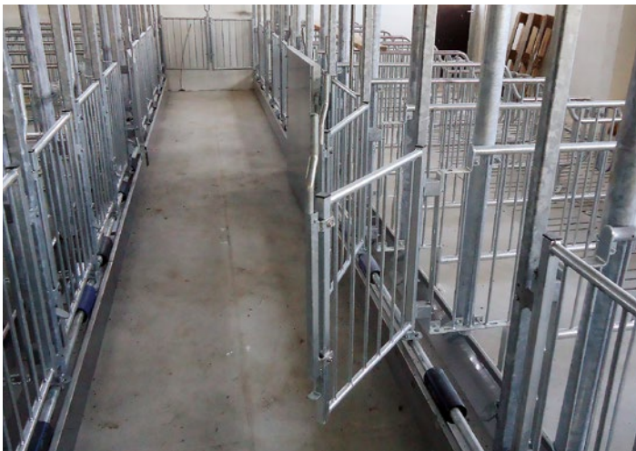
Mating stall with front exit