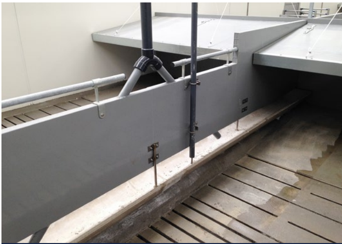
Finisher pen with integrated liquid feeding pipe