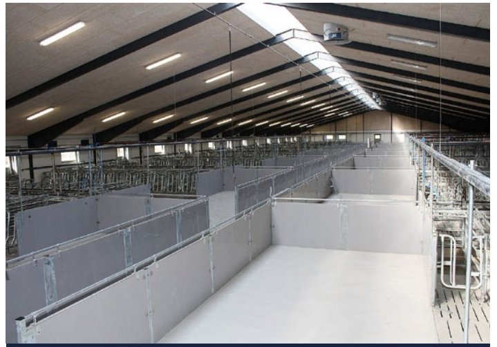
Gestation unit with free access stalls and free space area