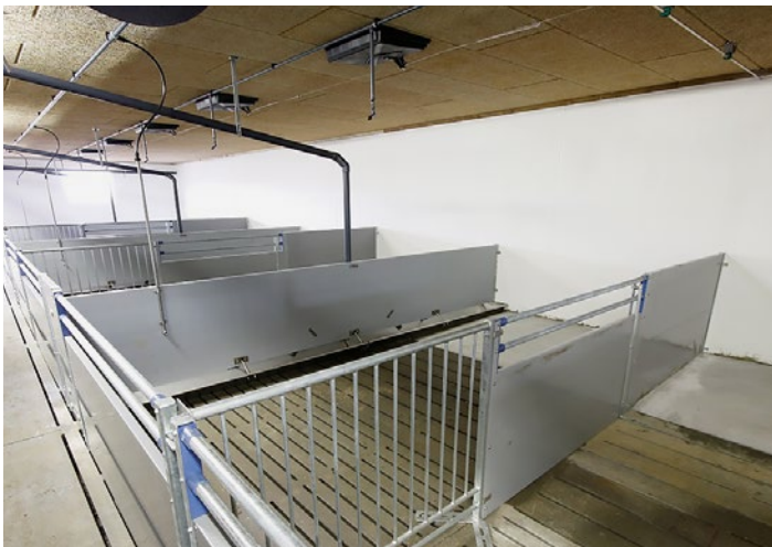
Finisher pen with liquid feeding