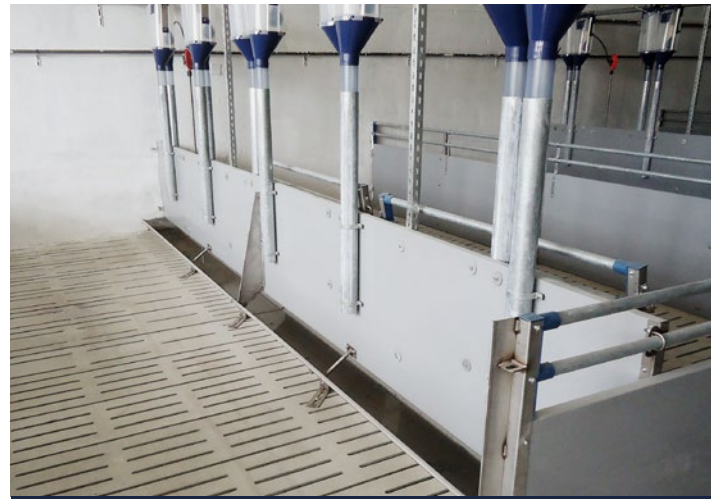
Stainless steel trough