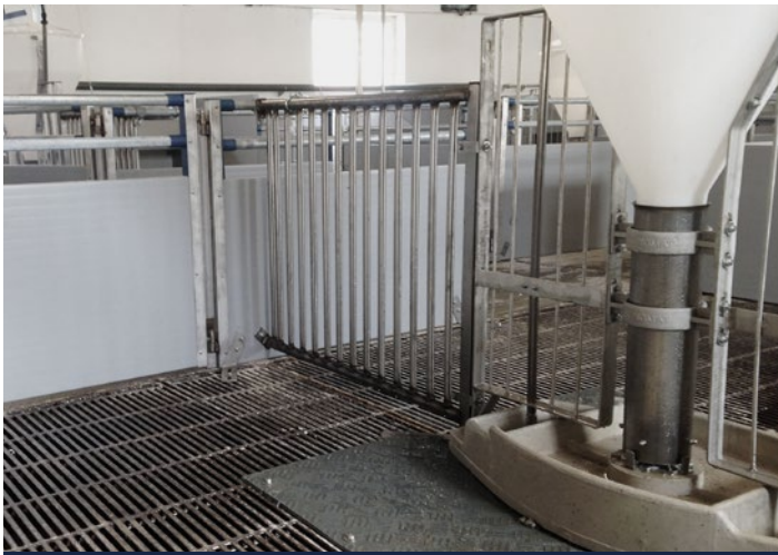
Small gate, contact grid and ad lib feeder